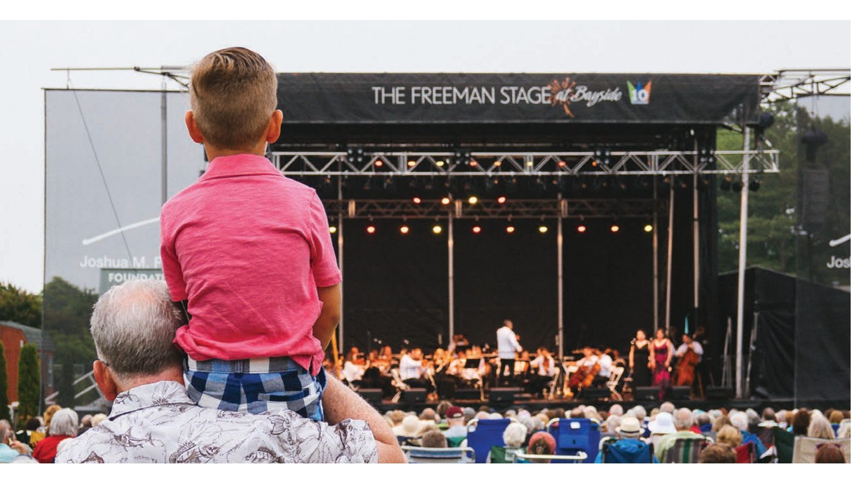
Our Core Purpose